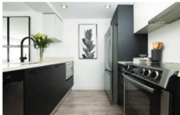
After this Vancouver condominium received an affordable update using Bodaq Interior Film.

THIS STORY WAS CREATED BY CONTENT WORKS, POSTMEDIA'S COMMERCIAL CONTENT DIVISION, ON BEHALF OF NELCOS DISTRIBUTION INC.